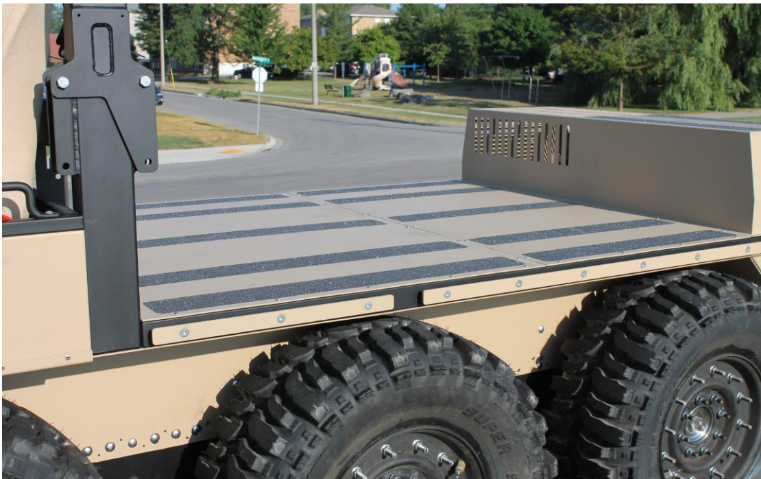
CENTRAL PAYLOAD DECK PROVIDES 750 KG OF PAYLOAD CAPACITY, TOTAL PAYLOAD OF 1,000 KG