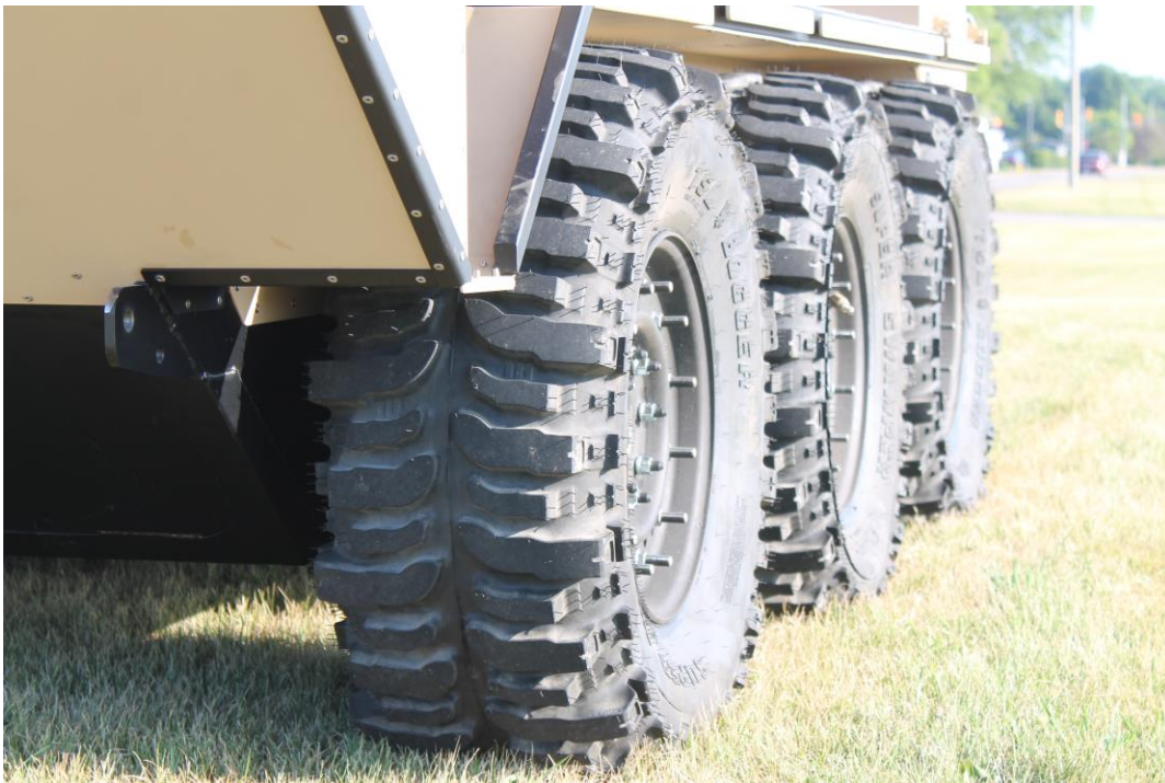
HIGH CAPACITY ROAD-LEGAL TIRES MOUNTED ON DUAL BEADLOCK WHEELS PROVIDE HIGH RELIABILITY IN ALL CONDITIONS – PAVEMENT, ROCKS, MUD, ETC.