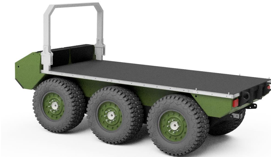
LARGE PAYLOAD DECK; 1,000 KG OF PAYLOAD CAPACITY