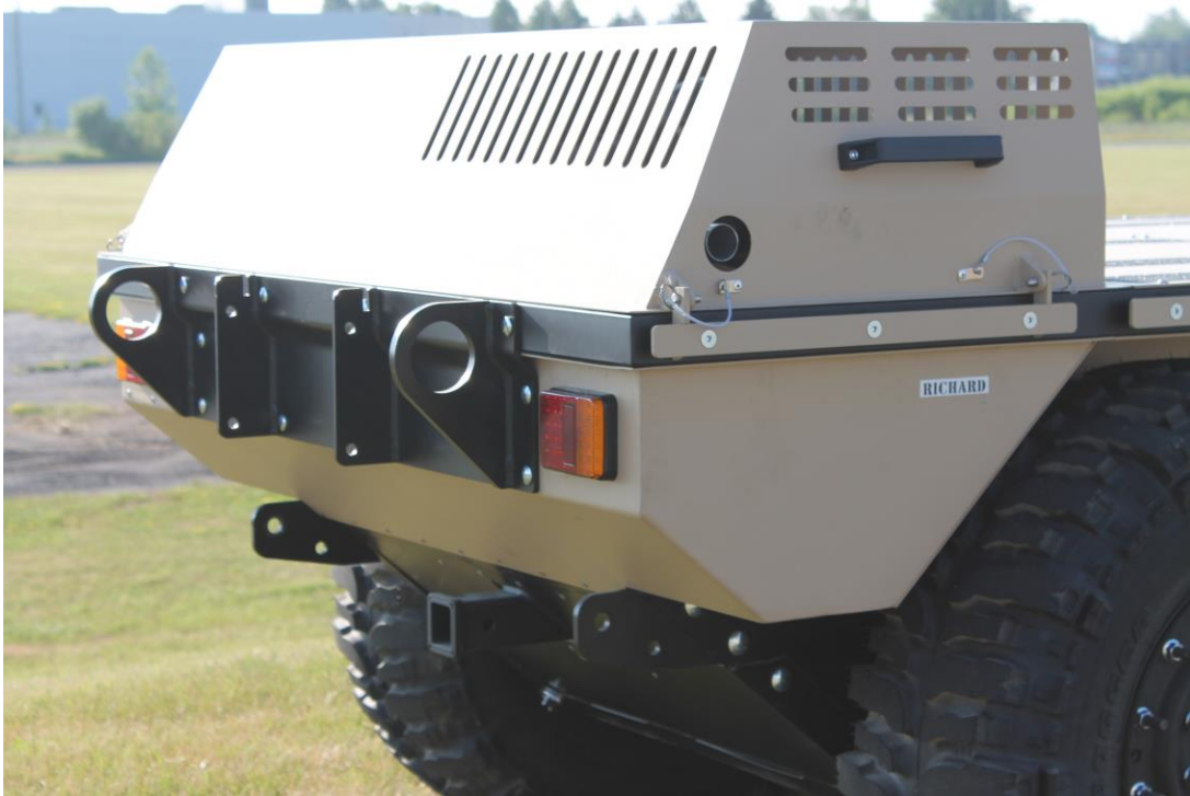
OPTIONAL REAR MOUNT DIESEL GENERATOR PROVIDES 13 KW OF ELECTRICAL POWER