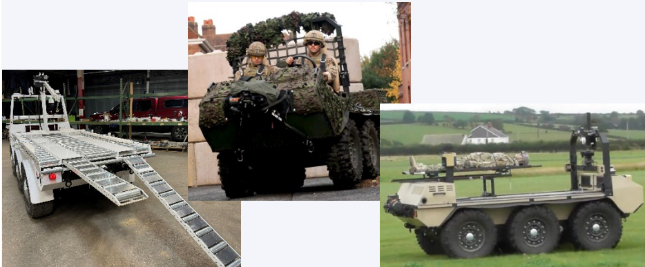
Sample customer configurations of RAPTOR and HAWC