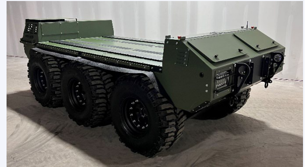
RAPTOR (above) and HAWC (below)

HAWC is an optionally-crewed version of RAPTOR, fitted with 2 crew seats and automotive-style secondary controls.